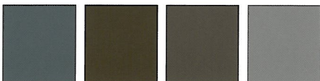
195-5 CASTLE STONE GRAY 195-6 BELGIUM CHOCOLATE 195-7 TUSCANY TAUPE 195-8 LONDON GRAY