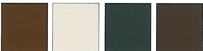
195-9 ENGLISH COTTAGE 195-10 PARIS PEARL 195-11 JET BLACK 195-12 ENGLISH MANOR ROSE