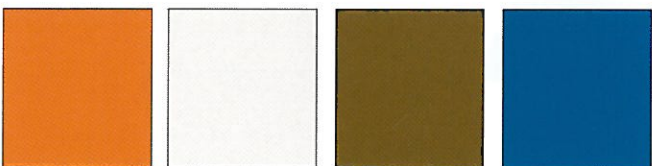
195-13 SPANISH GOLD 195-14 BRIGHT WHITE 195-15 SPA SIERRA TAN 195-16 MEDITERRANEAN BLUE

CTi's Euro Bond System provides you with the ability to have custom marble or granite surfaces in a fraction of the time and expense when compared to the actual products. What is even better is the Euro Bond System is extremely durable and can be applied directly over such surfaces as laminate and concrete.